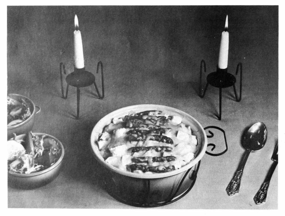
Curried Halibut Casserole

Combine fish and cream; mix well. Arrange toast on a baking sheet and cover each slice with fish mixture. Combine remaining ingredients. Cover fish with mayonnaise mixture. Bake in a moderate oven, 350° F., for 15 minutes or until brown. Serves 6.